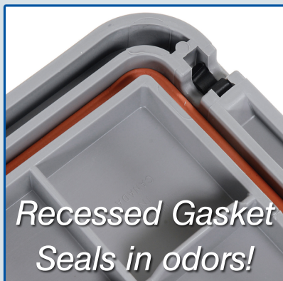
Recessed Gasket Seals in odors!