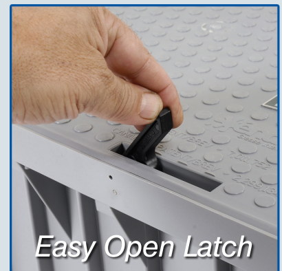
Easy Open Latch