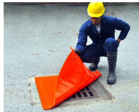
Ultra-Drain Seal helps seal off drains to minimize problems!

* Will cause the Ultra-Drain Seal™ to swell temporarily but not degrade.